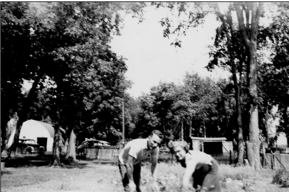
Son Wally and Helen in flower beds, c 1948-49. Note all the elm trees and the fencing to keep chickens from scratching in the flower beds!

house and farm buildings could not be saved. The barn had collapsed, the granaries had blown off their foundations and their leaking roofs had rotted the floors,